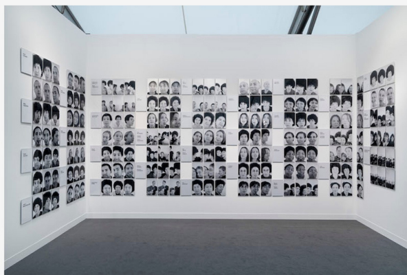
Sonia Boyce (b. 1962) (Gallery: Apalazzo Gallery) The Audition 1997.

María Balshaw, Director, Tate said, "The Frieze Tate Fund has made an important contribution to the national collection of contemporary art at Tate. We are once again excited to be able to select work from Frieze so that a broad public at Tate can experience new art as it emerges. We are extremely grateful both to Endeavor and to Frieze for their support."